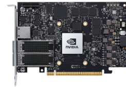
BlueField-2 DPU - 2x 100Gb/s FHHL form factor