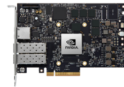
BlueField-2 DPU - 2x 25Gb/s HHHL form factor